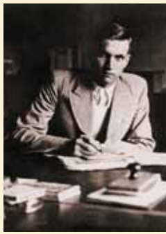
Jan Karski at his desk, Warsaw, 1939.

The history of the hero of the Polish Underground State interpreted by illustrator Neal Adams—the author of such iconic US comic book series as The X-Men and Batman. Narrated by Polish actor Maciej Stuhr.